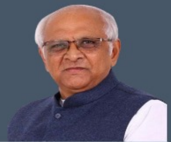
Shri Bhupendrabhai Patel (Chief Minister of Gujarat)