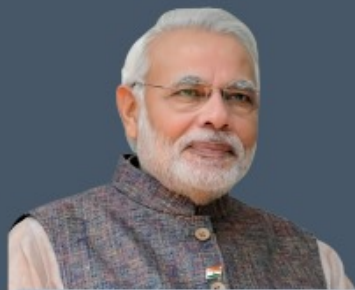
Shri Narendraabhai Modi (Prime Minister of India)